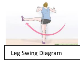
Leg Swing Diagram