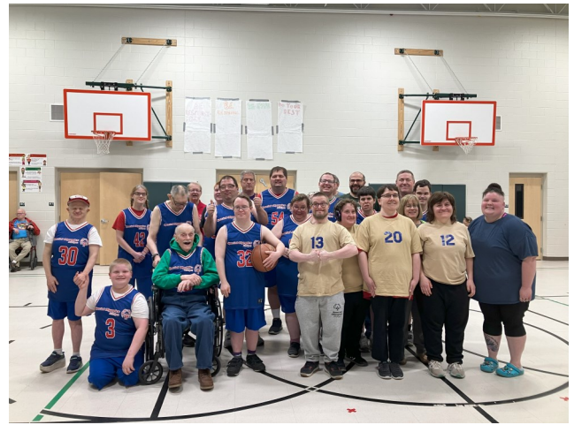
Basketball Skills Athletes from A30 and A13