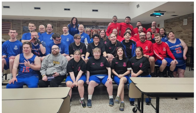
Our new basketball t-shirts. Our athletes look awesome!!